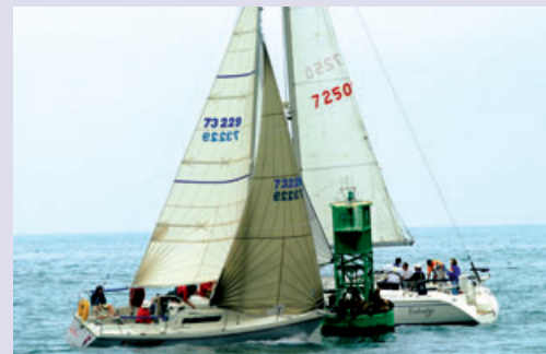
"Celebrity", first place winner in the Cruising Class category rounds the buoy with "Avet", the second place finisher in the Class B category, close behind.