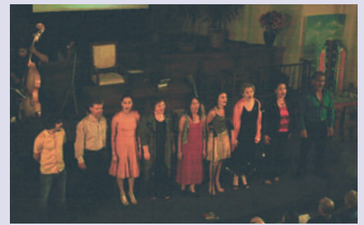
The vocalist from the "What I Did for Love" concert in Ventura, CA.