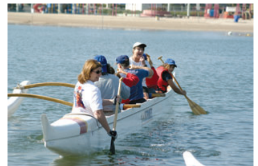
Looks like the "Blue" team finds themselves in a bit of a jam at the 2005 Paddle for a Purpose kayak race.