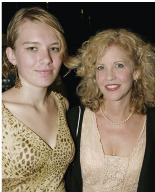
Actress and Program Director at weSpark, Nancy Allen (right) with daughter.